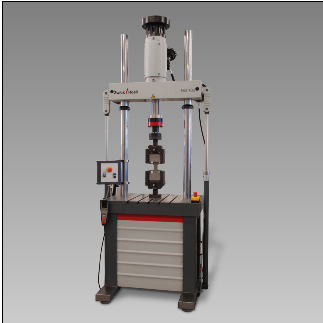
HB100 with T-slotted platform and mechanical grips