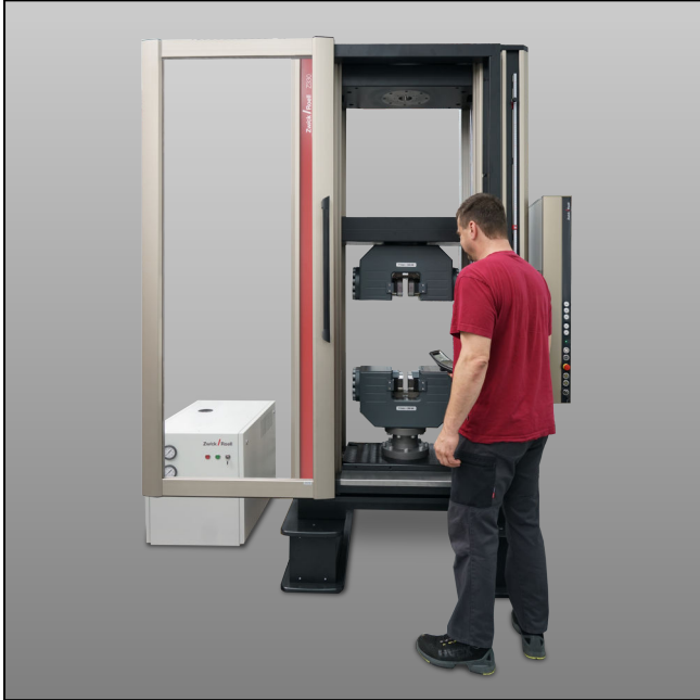
Z330E with hydraulic grips